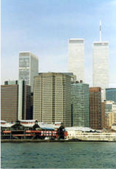
WORLD TRADE CENTER

September 11, 2001 attacks shattered the World Trade Center which took the lives of more than 3,000 people. The Freedom Tower is planned to be built on the same site by 2012.