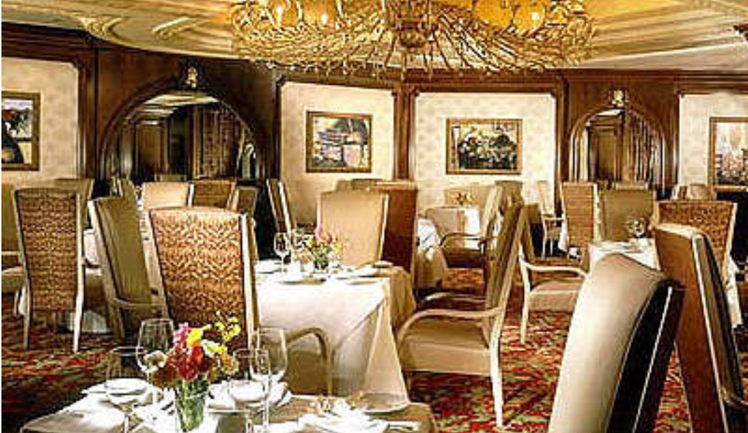
POLO'S DINING HALL

Polo restaurant satisfies the taste buds whether it is brunch, tea or full time dinner. Its Sunday brunch is know for its special menu including- sushi, meat carving, pasta, omelets and waffles. Other everyday hits of this restaurant are - cold salads, crab legs, shrimp, fresh fruit platter, cheese platters and much more sizzling stuff.